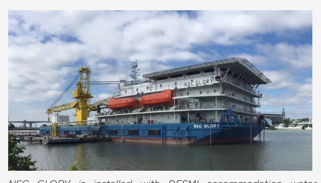
NSC GLORY is installed with DESMI accommodation water sprinkler + Local Application + Helideck foam protection fire-fighting systems.

Algoma is a leading Canadian shipping company, owning and operating the largest Canadian flag fleet of dry-bulk carriers and product tankers on the Great Lakes - St. Lawrence Waterway. Algoma operates 17 self-unloading dry-bulk carriers, seven gearless dry bulk carriers and seven product tankers. The company is a leader in dry-bulk and liquid bulk transportation focused on meeting the special needs of customers who ship products on the Great Lakes and St. Lawrence Waterway. Algoma's dry-bulk fleet includes vessels of different sizes and configurations, providing flexible shipping options for customers.