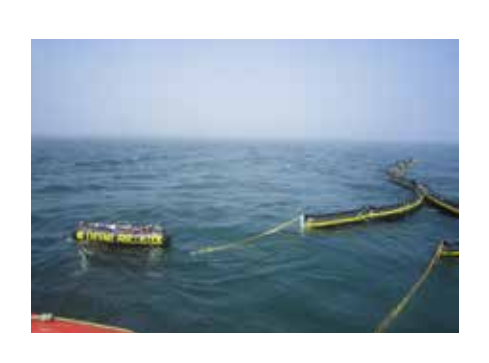
Ro-Kite Starts Towing Speed-Sweep