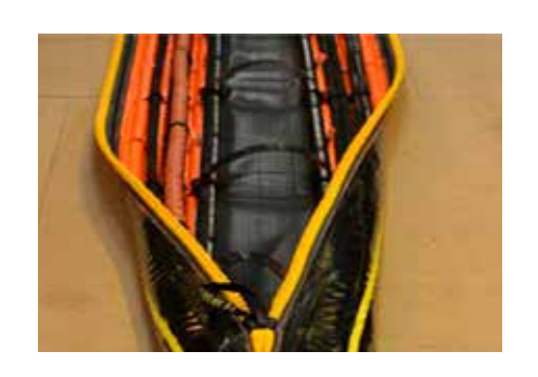
Zipper sleeve for hydraulic hoses