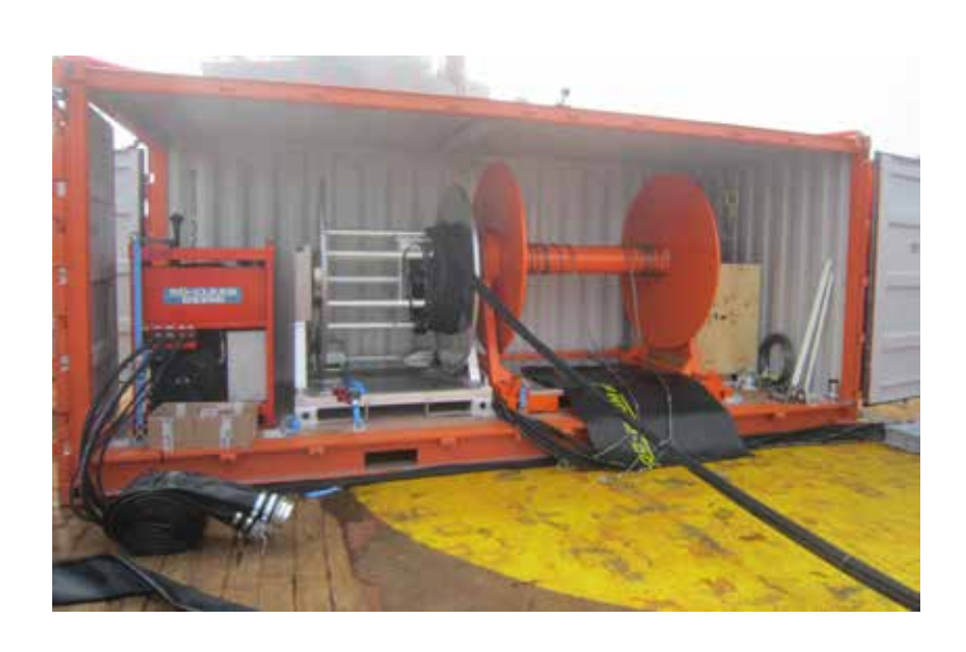
ZUH hose and Speed-Sweep launched