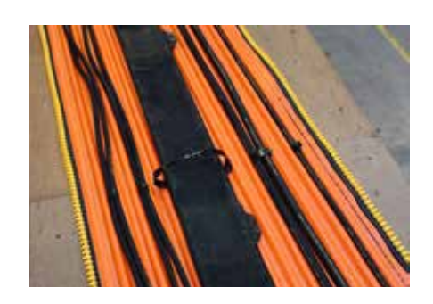
Zipper sleeve for hydraulic hoses