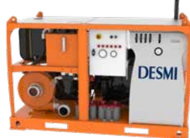
See more on page 14