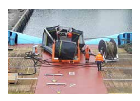
Speed-Sweep 2000 prepared for deployment