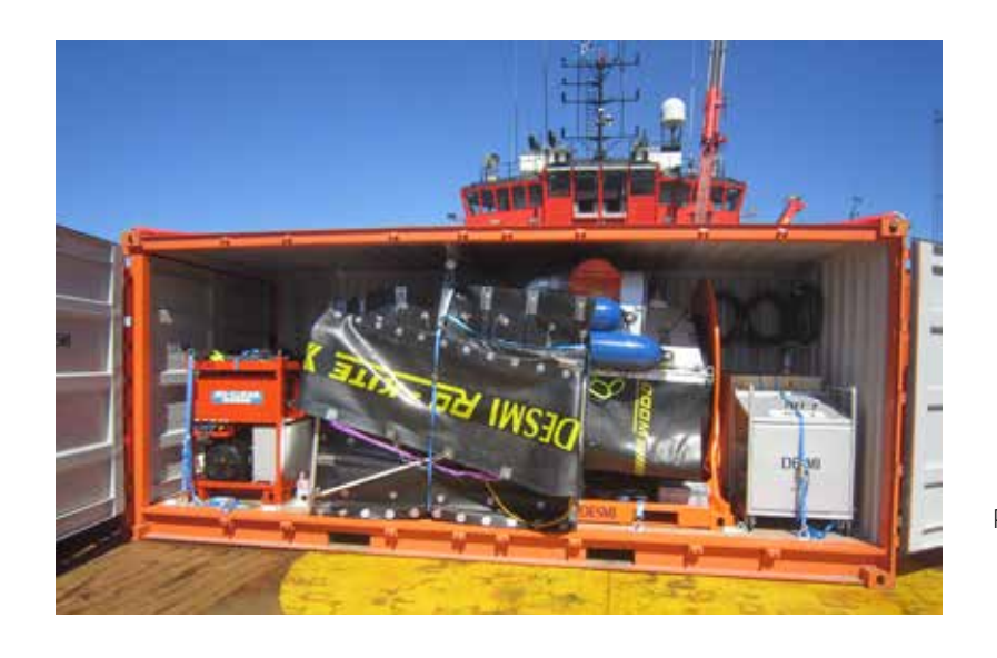
20" Container comprising of 50kW Power Pack, DESMI Speed-Sweep 1500 and Guide Boom, ZUH-hose on Reel, Ro-Skim 1500 and Ro-Kite 1500.