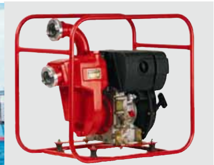
All information is subject to change, and pictures are for illustration purposes only, and not necessarily correct.

- Contact one of the offices below for further information