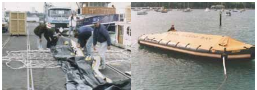
All information is subject to change, and pictures are for illustration purposes only, and not necessarily correct.

- Contact one of the offices below for further information