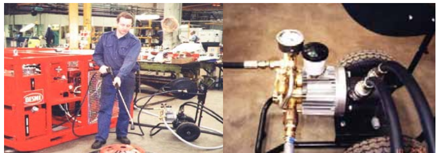
All information is subject to change, and pictures are for illustration purposes only, and not necessarily correct.

- Contact one of the offices below for further information