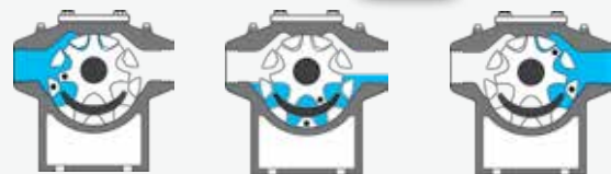
Method of operation