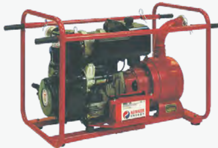
S70-50-175/A11 for quick priming Capacity: 20-50 m 3 /h x 55-20 mLC.