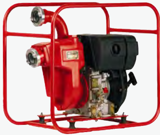
SA50T Engine sizes: Type 1B20, 3.4 kW at 3600 rpm Type 1B30, 5.0 kW at 3600 rpm Capacity: 24 m 3 /h x 26 mLC.